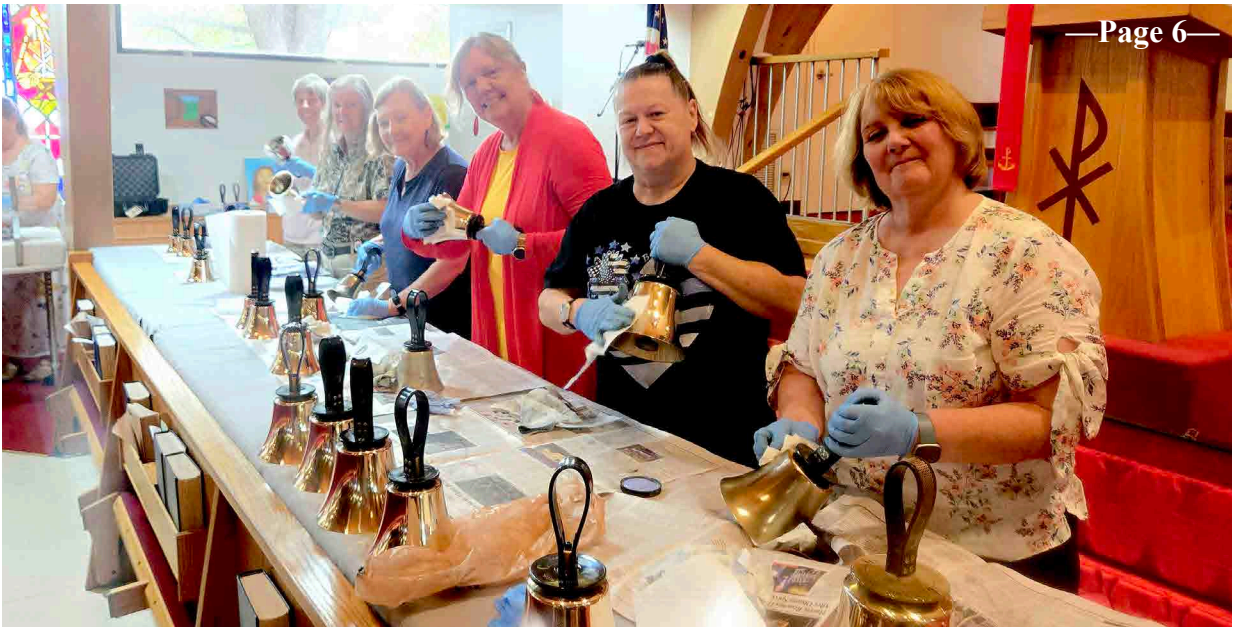
POLISH & POTLUCK (WEDNESDAY, MAY 27, 2026) Our Savior's Handbell Group works hard to ring music that is to God's glory and your worship edification. But, it's not all fun and games. At our "Polish and Potluck" evening, they went through our 4 1/2 octaves and polished them until they are bright and shiny. And yes, then they ate well!