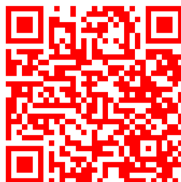
YouTube (Our Savior Lutheran Church Plantation)