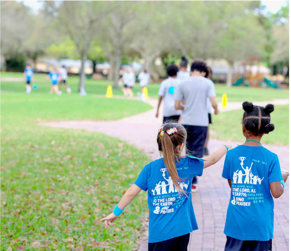
Walk-a-Thon Fundraiser at Our Savior Lutheran School Friday, March 6, 2026 (p.4-5).

Our Savior Lutheran Church Newsletter | March 15, 2026