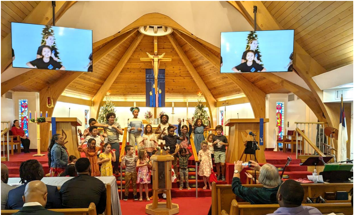
Kids Connect music rehearsal on Sun. Dec. 17 th , 10:30 service

The Church building (including Lutherhall and the church office) will be tented for termites starting Tues, Dec. 26 th until Fri, Dec. 29 th . Please be aware that during this time, staff members will not be available in the church office to answer calls or assist in in-person needs. However, you can always reach out to us by email (please see back of newsletter). Please also keep in mind that all open food and drink items will need to be removed not only from the church, but also, the kitchen, bays, classrooms and school office. These areas will not be safe to enter and will be off limits during the tenting process. The elementary building will not be affected by the tenting. Church services on Dec. 31 st will proceed as normal.